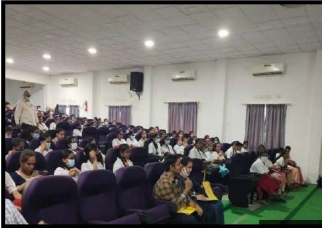
Active participation of students and staff