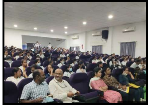
Presentations by the students followed by certificate distribution