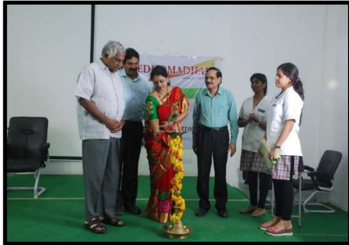
Dignitaries lighting the lamp and addressing the gathering