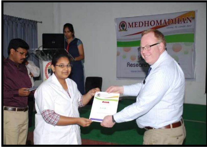
Group picture of the dignitaries and students