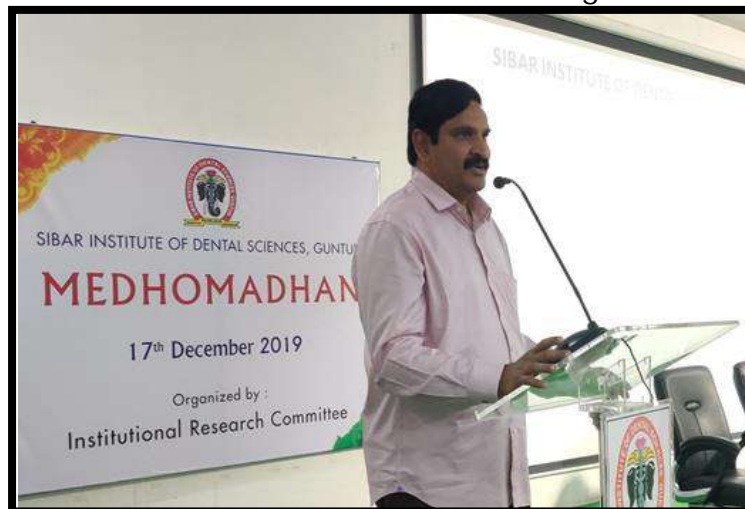
Chief guest addressing the event