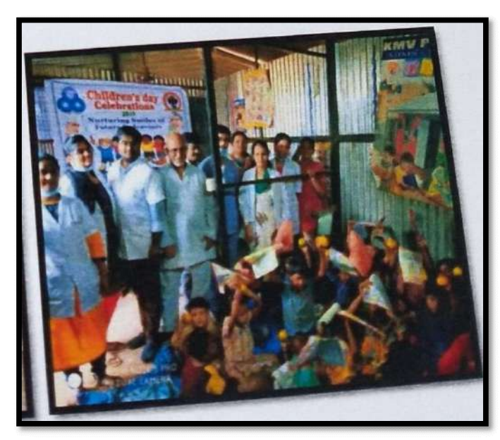
TREATMENT CAMP AT THE ORPHANAGE