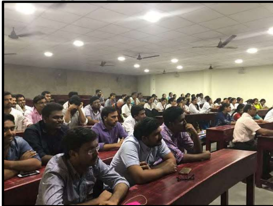
LECTURE ON THE ART OF TREATMENT PLANNING AND CASE PRESENTATION ON 25/10/2017