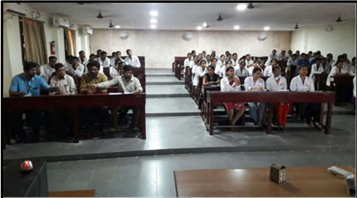
LECTURE ON TRAINING ON EBSCO JOURNAL PLATFORM ON 02/02/2018