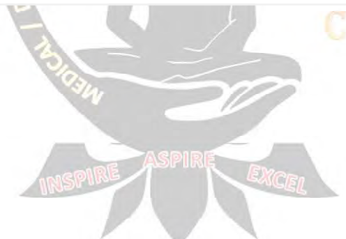
LECTURE ON SOCIAL MEDIA MARKETING FOR DENTAL PROFESSIONALS BY RITA ZAMORA ON 09/03/2018