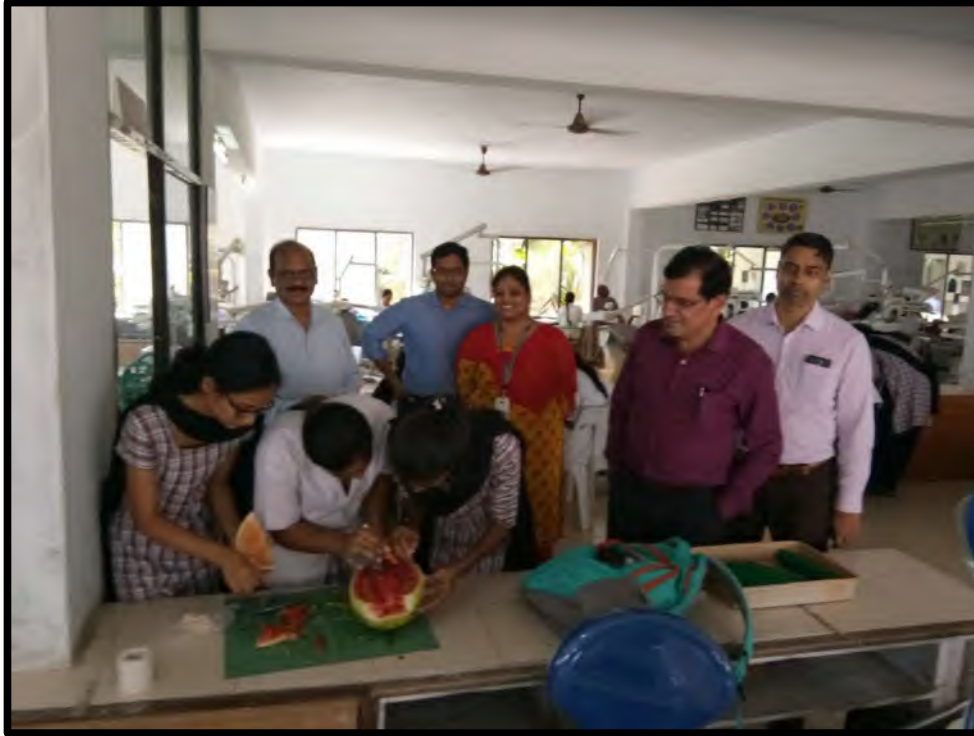
LECTURE ON IMPORTANCE OF CONSERVING A TOOTH ON 5/03/2018