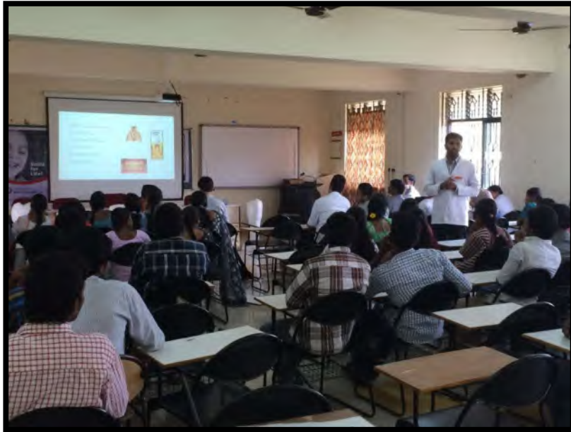
LECTURE ON ORAL HEALTH AND DENTAL TREATMENT FOR THE PREGNANT PATIENT ON 11/05/2018