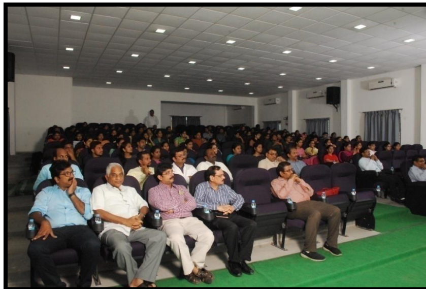
PARTICIPANTS LISTENING TO THE LECTURE LIST OF PARTICIPANTS